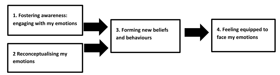
Fig. 4 Thematic map of themes and subthemes

particularly through identifying and recognising secondary emotions. For example, one participant noted the value of logging and mapping their emotions: